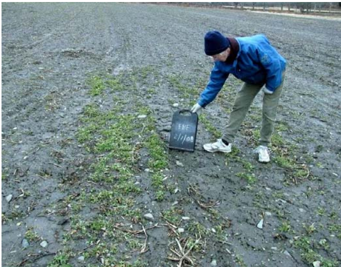
Rye and peas planted, only peas remain